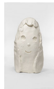
Yoshitomo Nara Long Tall Peace Sister, 2024