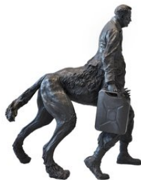
Neo Rauch, Nachhut, 2011 Courtesy Galerie Eigen + Art Berlin/Leipzig Copyright Neo Rauch VG Bildkunst Bonn Foto Uwe Walter Berlin

Curator Ralph Keuning: "The liberal spirit of Amsterdam is a mental state that makes this city a place of freedom, tolerance, solidarity as well as a breeding ground for new ideas. As a trading city, Amsterdam has been a point of departure from which the world's oceans have been sailed, while also having attracted independent people from all over the world for centuries, who have helped shape it into the metropolis it is today. The title Enlightenment references the belief in progress that characterized the 18th century. A century of reason in which science and art flourished and the foundation for our democracy was laid. Simultaneously, the city has the dark history of colonialism. This paradox of progress and flourishing on the one hand and exclusion and persecution on the other is just as topical now as it was then, and is part of the discourse in the city, in art and thus, on the green lanes of ARTZUID 2025. At the other end of the spectrum, Enlightenment can also be understood literally as easing our worries, relaxing, dreaming away, fantasizing and finding beauty. We also want to bring that about with this edition of ARTZUID."