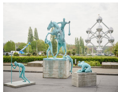
Atelier Van Lieshout The Monument, 2015