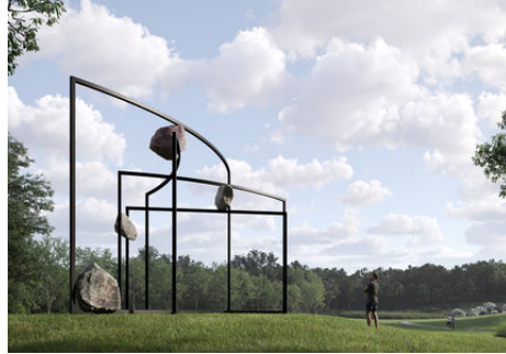
Alicja Kwade MatterMotion, 2023